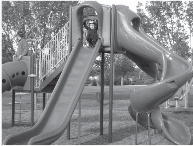
A local boy is the first one to try out the new slide at Franconia Community Park.