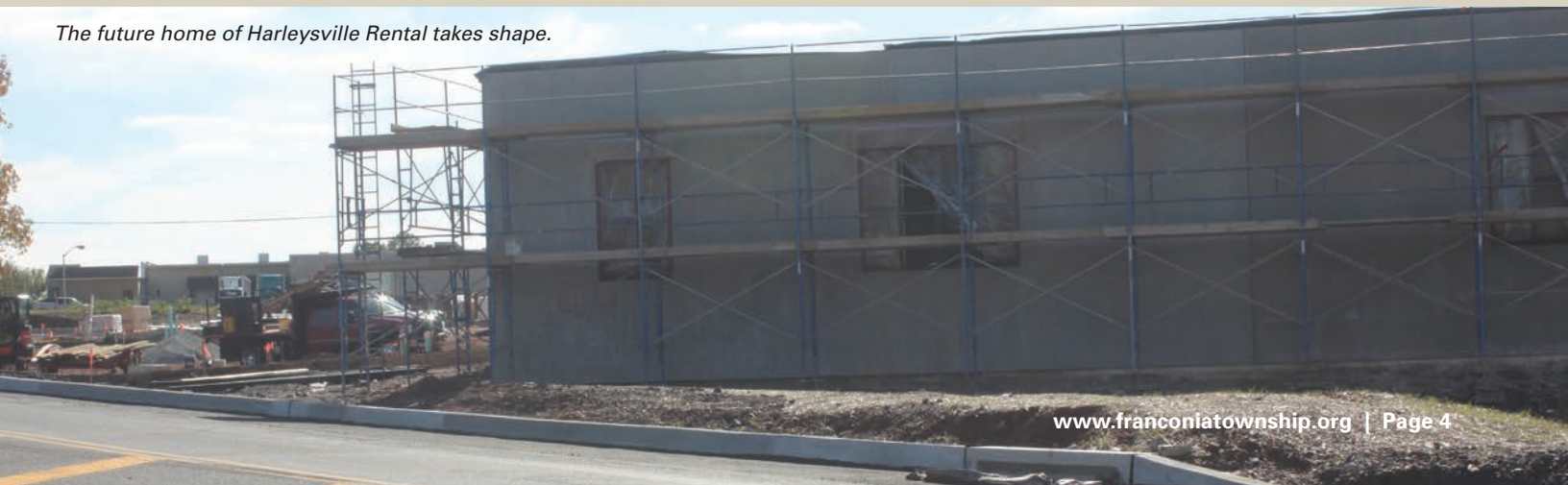
The future home of Harleysville Rental takes shape.