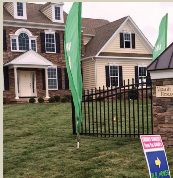
Work continues at the Vistas residential development at Crestwood Drive and Hunsicker Road.