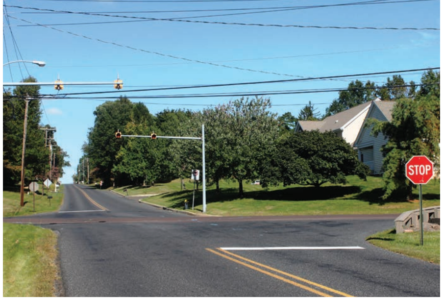
A four-way stop sign and dual flashing red light will be added at the intersection of Cowpath and Reliance roads.

On September 21, the Board of Supervisors approved Resolution # 15-25-21-09. This was a Resolution authorizing the Township to submit an application for a traffic signal upgrade to the Pennsylvania Department of Transportation. The signal upgrade will take place at the intersection of Cowpath Road and Reliance Road. A four-way stop will be added to the intersection along with a dual flashing red light. In 2014, the Township requested a traffic study be performed at the intersection to see if improvements were warranted. The traffic study was performed and the intersection was approved for the upgrades noted above. The improvements are anticipated to be completed by the end of 2015.