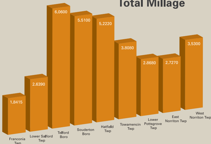
Franconia's tax rates have remained much lower than those of surrounding, comparable municipalities.