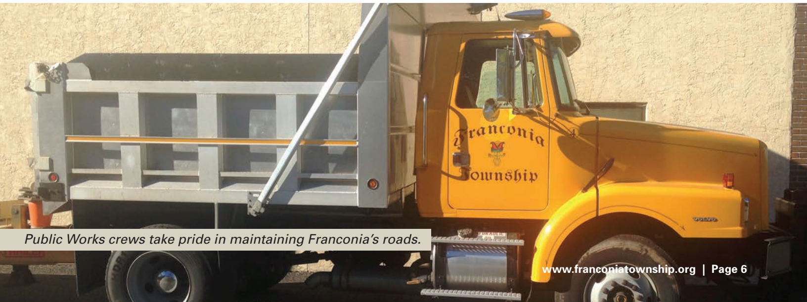
Public Works crews take pride in maintaining Franconia's roads.

The Township Public Works Department will be working on various improvements to each of these roadways over the next 3 years. Work will start with some much needed storm drainage on Cowpath near Route 113 and a section of curbing will be completed near the Reliance Road intersection, which will include road widening and base repair in preparation for paving in 2016.