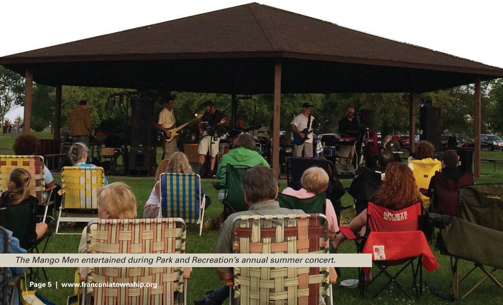
The Mango Men entertained during Park and Recreation's annual summer concert.