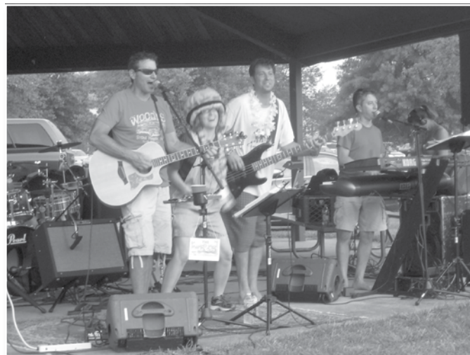
Mango Men perform at the Community Park in July.