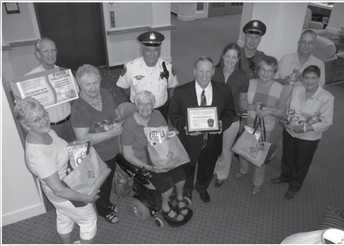
NNO Food Drive 1st place winners - Peter Becker Community @ Maplewood Estates