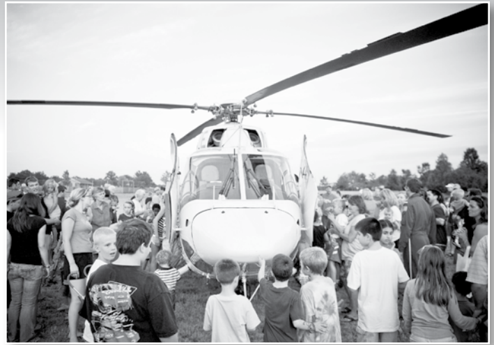
MedEvac helicopter landing